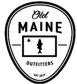
OLD MAINE OUTFITTERS