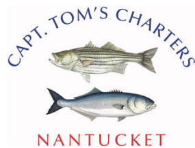
CAPT. TOMS CHARTERS