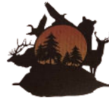
HOWE SAFETY SERVICES