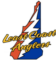
LEAST COAST ANGLERS