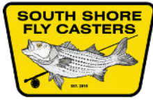
SOUTH SHORE FLY CASTERS