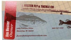
HESTER FLY & TACKLE CO