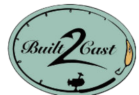
BUILT 2 CAST