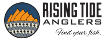
RISING TIDE ANGLERS