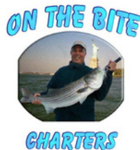
ON THE BITE CHARTERS