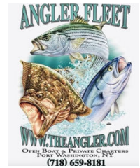
THE ANGLER FLEET