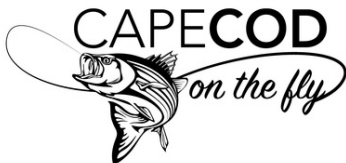
CAPE COD ON THE FLY