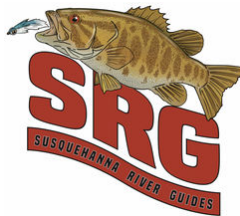
SUSQUEHANNA RIVER GUIDES