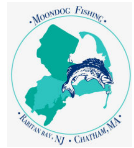
MOONDOG FISHING LLC