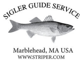
SIGLER GUIDE SERVICE