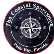
THE COASTAL SPORTSMAN