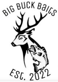
BIG BUCK BAITS