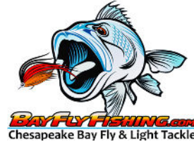
BAY FLY FISHING