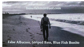
BONEFISH MON CHARTERS