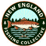
NEW ENGLAND FISHING COLLECTIVE