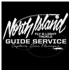
NORTH ISLAND GUIDE SERVICE