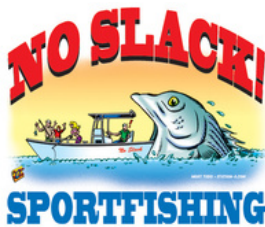
NO SLACK SPORTFISHING