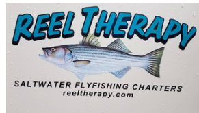
REEL THERAPY FISHING CHARTERS