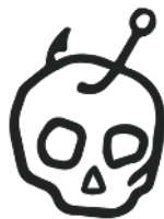
BADFISH SUPPLY CO