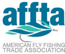
AMERICAN FLY FISHING TRADE ASSOCIATION