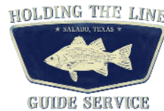
HOLDING THE LINE GUIDE SERVICE