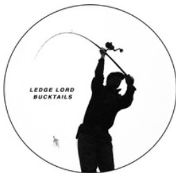
LEDGE LORD BUCKTAILS