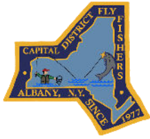
CAPITAL DISTRICT FLY FISHERS