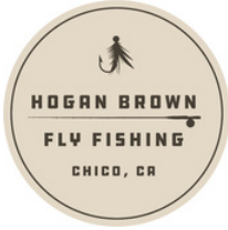
HOGAN BROWN FLY FISHING