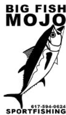
BIG FISH MOJO SPORTFISHING