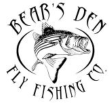
BEARS DEN FLY FISHING