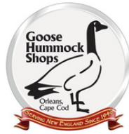
GOOSE HUMMOCK SHOPS