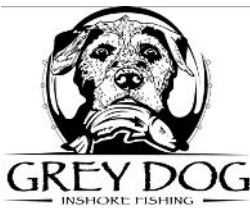
GREY DOG INSHORE FISHING