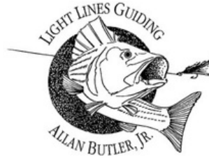
LIGHT LINES GUIDING