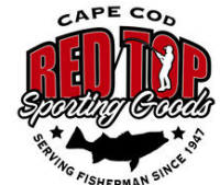
RED TOP SPORTING GOODS