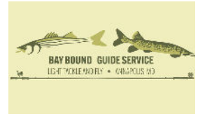
BAY BOUND GUIDE SERVICE