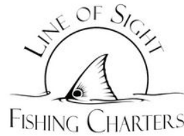
LINE OF SIGHT