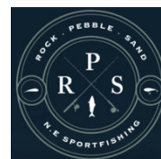
ROCK PEBBLE SAND FISHING