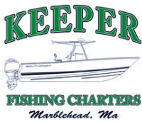
KEEPER FISHING CHARTERS