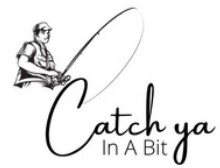
CATCH YA IN A BIT