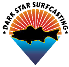
DARK STAR SURFCASTING