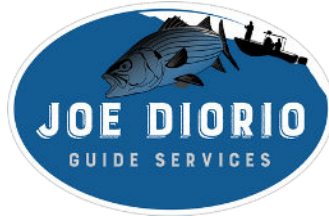
JOE DIORIO GUIDE SERVICE