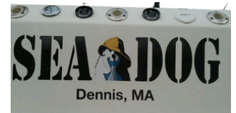
SEA DOG FISHING TEAM