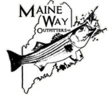
MAINE WAY OUTFITTERS