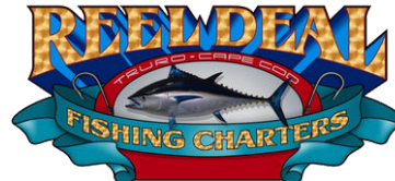
REEL DEAL CHARTERS