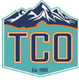
TCO Fly Fishing