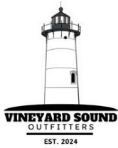
VINEYARD SOUND OUTFITTERS