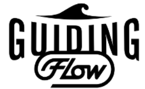
GUIDING FLOW TV