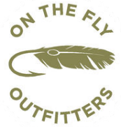
ON THE FLY OUTFITTERS