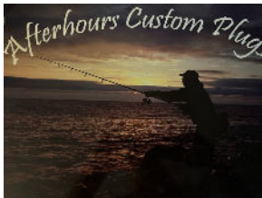
AFTERHOURS CUSTOM PLUGS