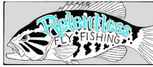
RELENTLESS FLY FISHING