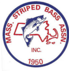
MASS. STRIPED BASS ASSOCIATION