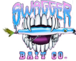
SWAGGER BAIT CO