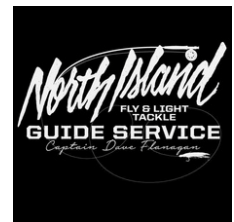
NORTH ISLAND GUIDE SERVICE