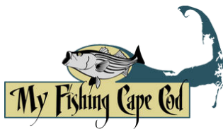
MY FISHING CAPE COD