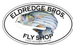
ELDREDGE BROTHERS FLY SHOP