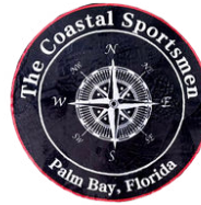
THE COASTAL SPORTSMAN